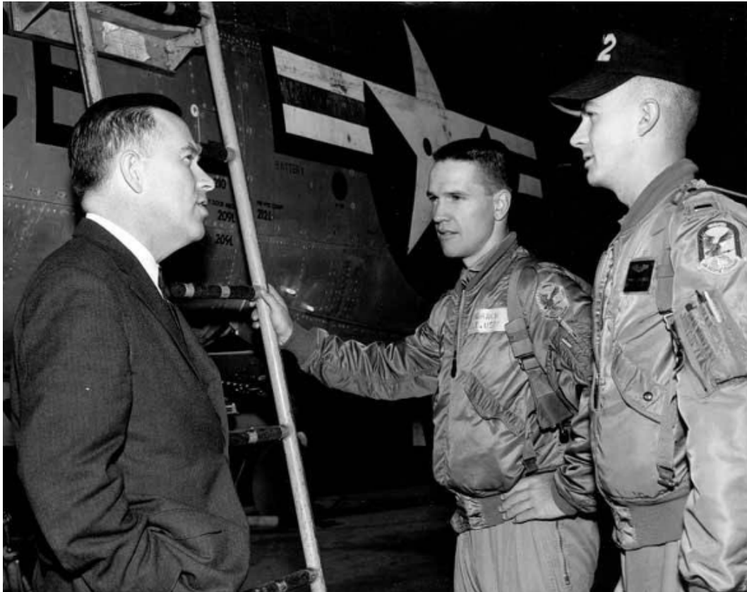
Senator Henry M. Jackson talking with members of the 322 Fighter Interceptor Squadron from Kingsley Field, Oregon, at McChord Air Force Base in Washington, 1961