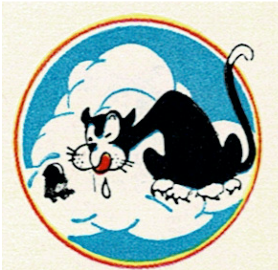
322d Fighter Squadron emblem